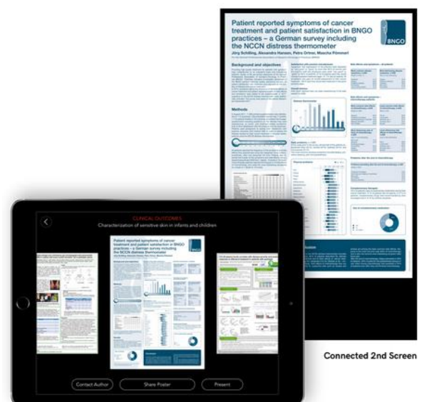
iPad as control unit